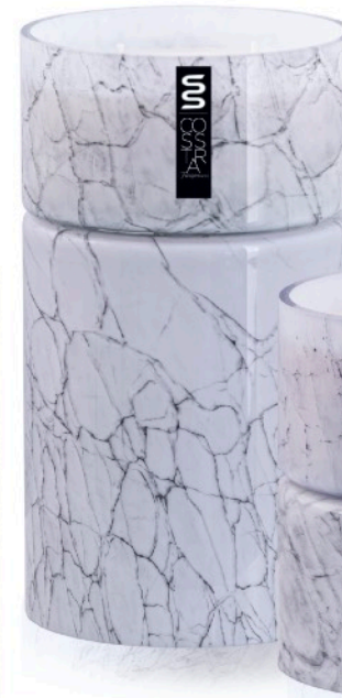
GL IDHLI 150