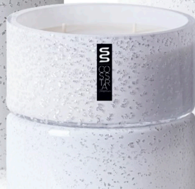
WL SDLLS 200