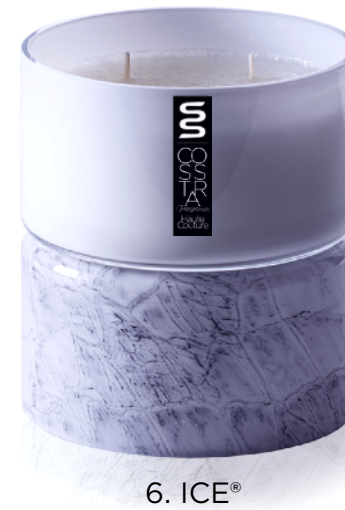
6. ICE® Collection