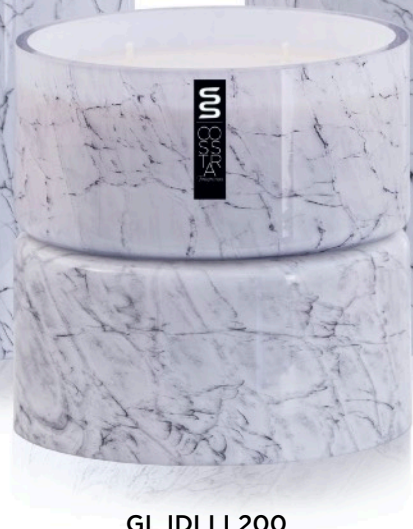
GL IDLLI 200