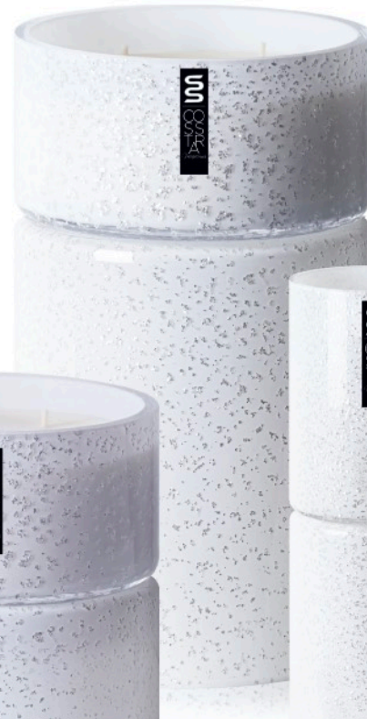
WL SDHLS 200