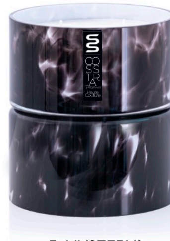
5. MYSTERY® Black Label® Collection