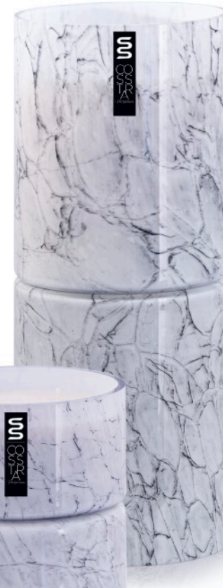
GL IDHHI 150