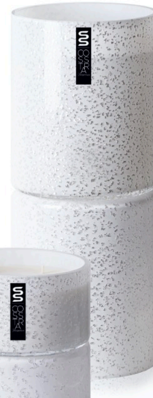
WL SDHHS 150