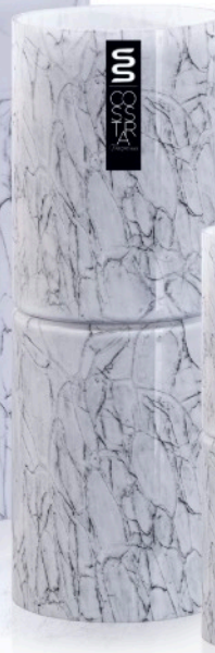
GL IDHHI 110