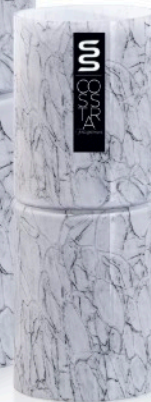
GL IDHHI 85