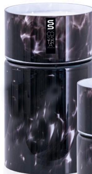
BL MDHLM 150