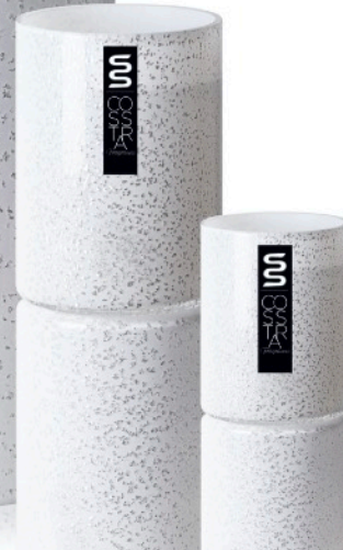
WL SDHHS 110