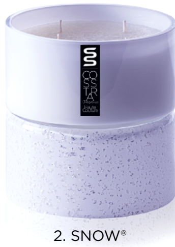
2. SNOW® Collection