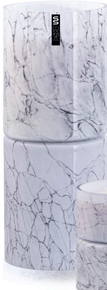
GL IDHHI 200