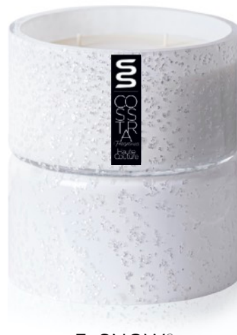
3. SNOW® White Label® Collection