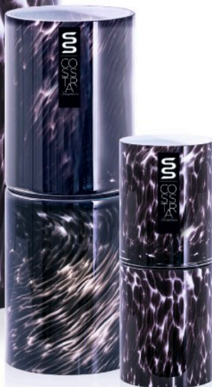
BL MDHMH 85