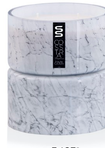
7. ICE® Grey Label® Collection