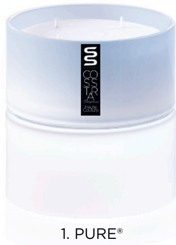
1. PURE® Collection