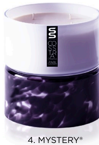
4. MYSTERY® Collection