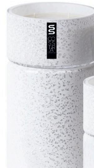
WL SDHLS 150