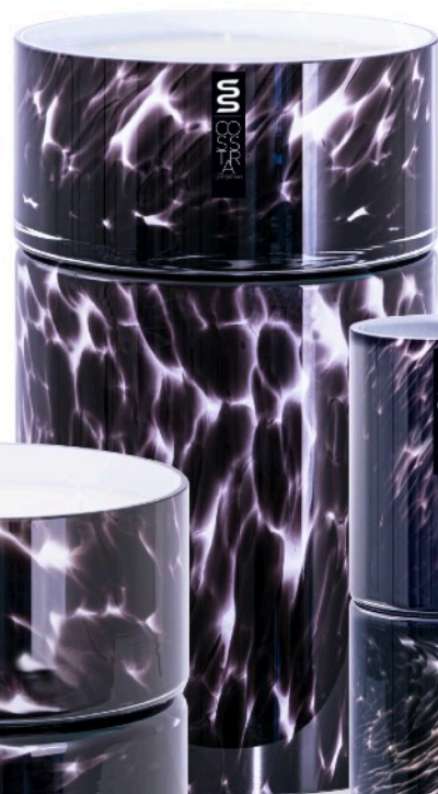
BL MDHLM 200