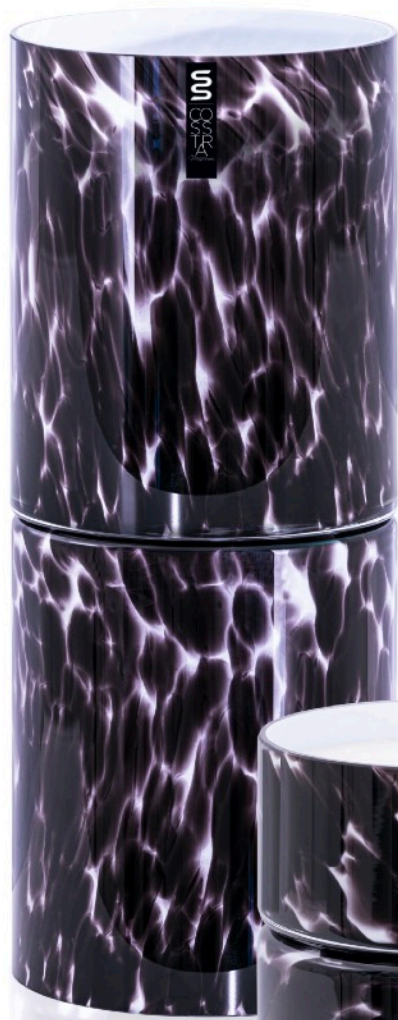
BL MDHMH 200