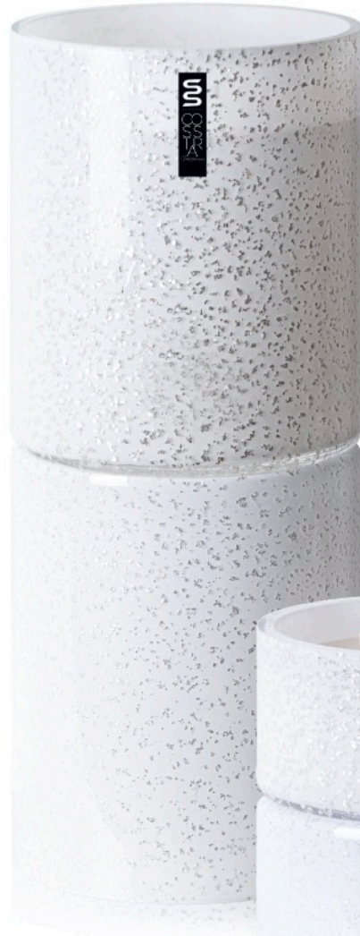
WL SDHHS 200