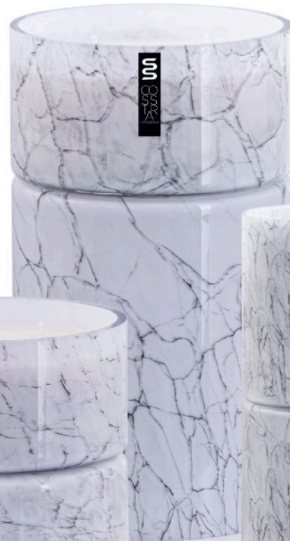
GL IDHLI 200