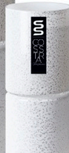
WL SDHHS 85