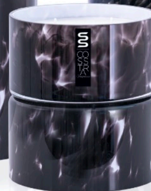
BL MDLLM 150